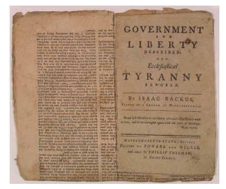
Isaac Backus pleads for Religious Freedom in person and print.